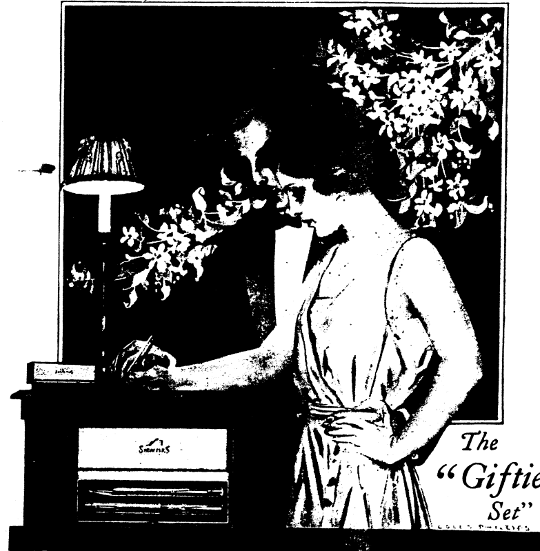
The "Giftie Set"